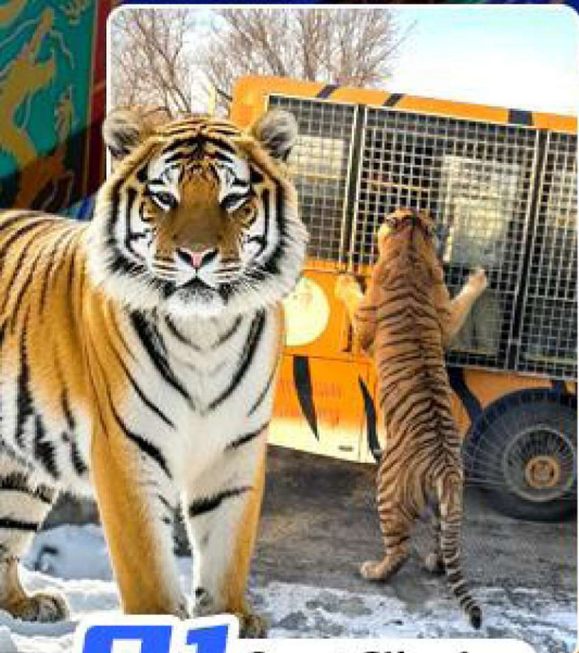
01 Greet Siberian