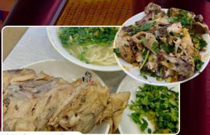
2 Taste Local Noodles and Grilled Chicken Ribs