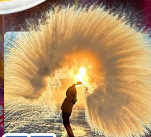
07 Water turns into ice.