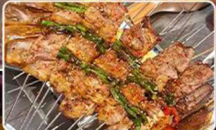
1 Taste Local BBQ & Beer