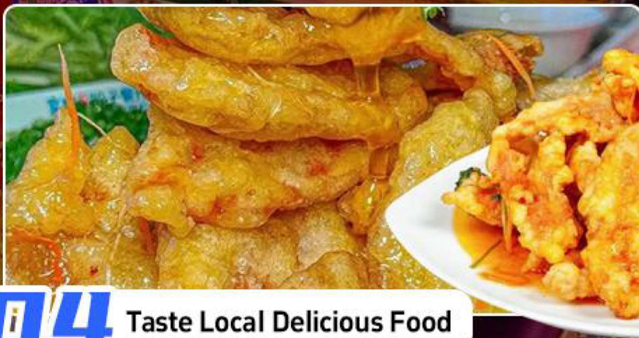
04 Taste Local Delicious Food