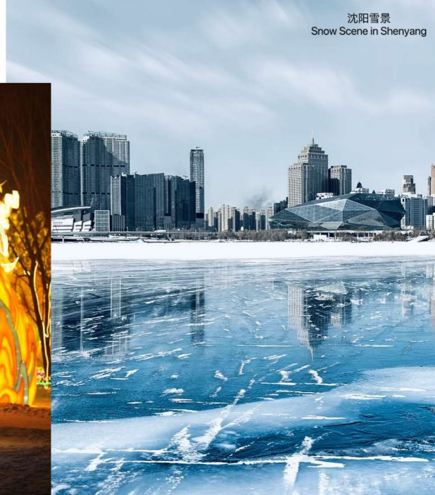
沈阳雪景 Snow Scene in Shenyang