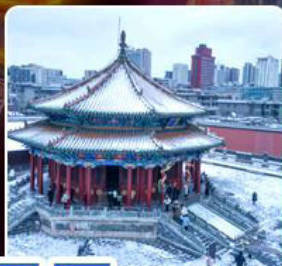
06 Shenyang Imperial Palace