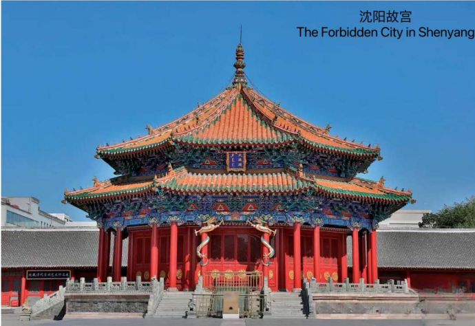
沈阳故宫 The Forbidden City in Shenyang