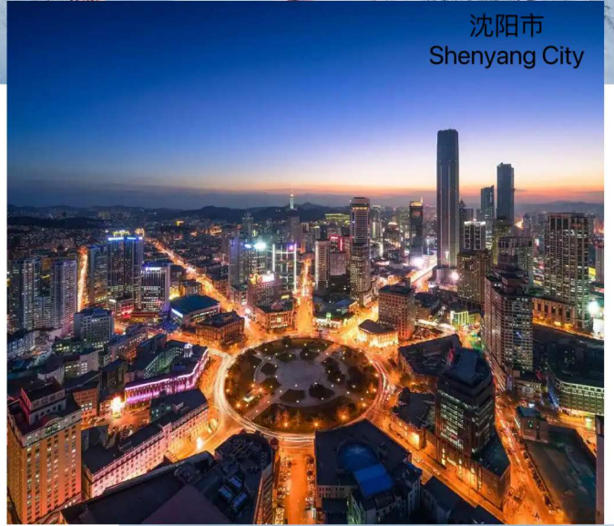
沈阳市 Shenyang City