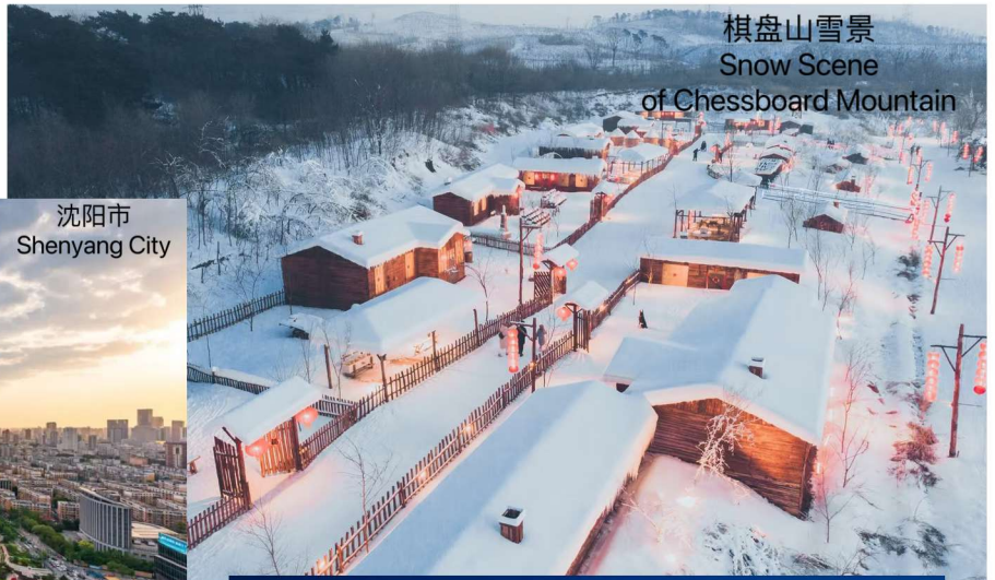
沈阳市 Shenyang City