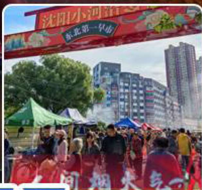
05 Shenyang early market