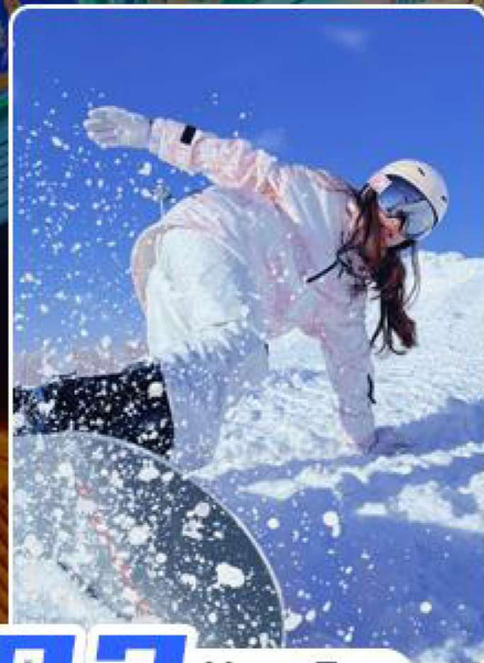
02 Have Fun